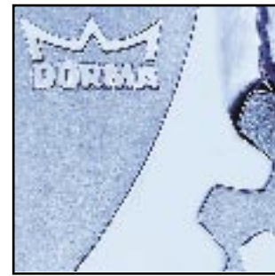
Chrome Plated Zinc Alloy Case